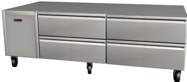
Model 20072RSB with optional casters