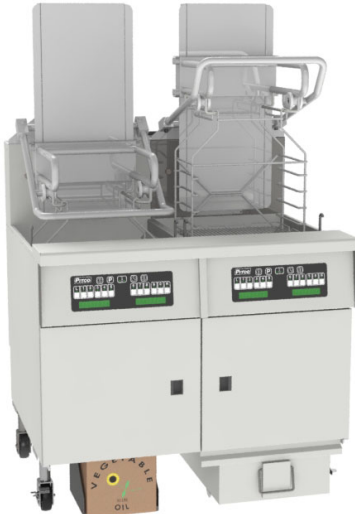
SGLVRF DUAL Shown with K12 computer, 9" front / rear casters