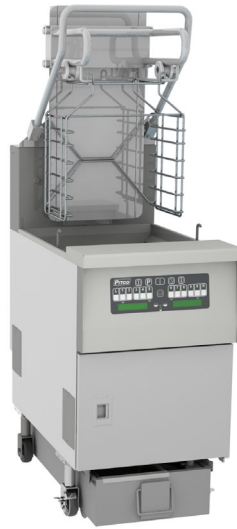
SFSELVRF Shown with K12 computer, 9" front / rear casters