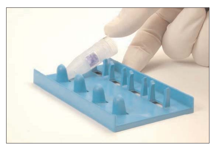
Figure 3: Insertion of the IBI FlexTube in the provided supporting tray. The arrow on the cap should be pointing upwards.

IMPORTANT: The two membranes of the IBI Flextube(s) must be in perpendicular to the electric field to permit the electric current to pass through the tube.