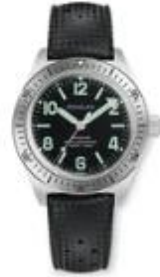
SKINDIVER PROFESSIONAL Ø 40MM | AUTOMATIC