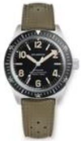
SKINDIVER AUTOMATIC Ø 40MM | AUTOMATIC