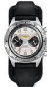
SKINDIVER WTD CHRONO-MECAQUARTZ Ø 40MM | CHRONOGRAPH