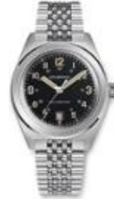
OUTRIDER AUTOMATIC Ø 39.5MM | AUTOMATIC