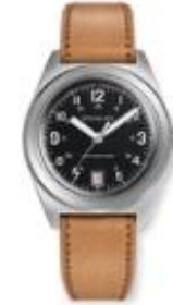
OUTRIDER PROFESSIONAL Ø 39.5MM | AUTOMATIC