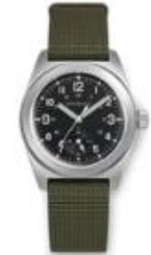
NEW! OUTRIDER PROFESSIONAL MECAQUARTZ Ø 38MM | QUARTZ