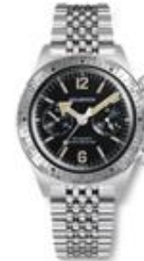
SKINDIVER WT CHRONO-MECAQUARTZ Ø 40MM | CHRONOGRAPH