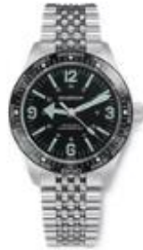
SKINDIVER WT MECAQUARTZ Ø 40MM | QUARTZ