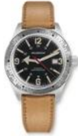
SKINDIVER WT AUTOMATIC Ø 40MM | AUTOMATIC