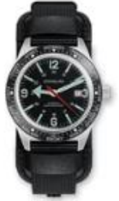
SKINDIVER WT PROFESSIONAL Ø 40MM | AUTOMATIC