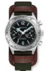
SKINDIVER WT PRO CHRONO-MECAQUARTZ Ø 40MM | CHRONOGRAPH