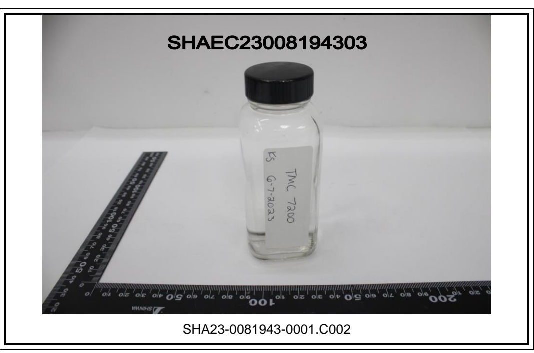
SGS authenticate the photo on original report only *** End of Report ***