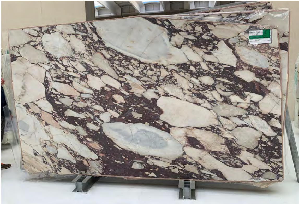
Full slab image of Calacatta Viola

This material offers amazing warmth and opulence, and with the slightly textured finish will constantly have you wanting to reach out and touch it..