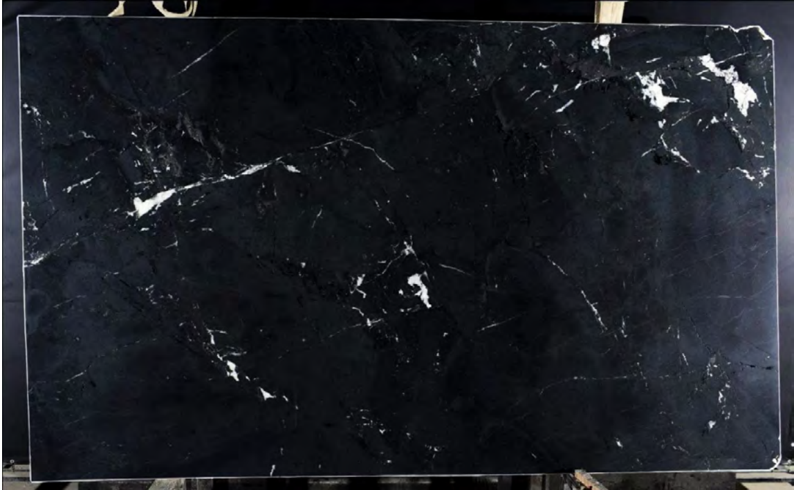
Full slab image of Negresco Quartzite

With dark chocolate tones and pops of white quartz it melds into a dark palate with ease. Finish in brushed, the stone has a marvelous texture that softens and warms.