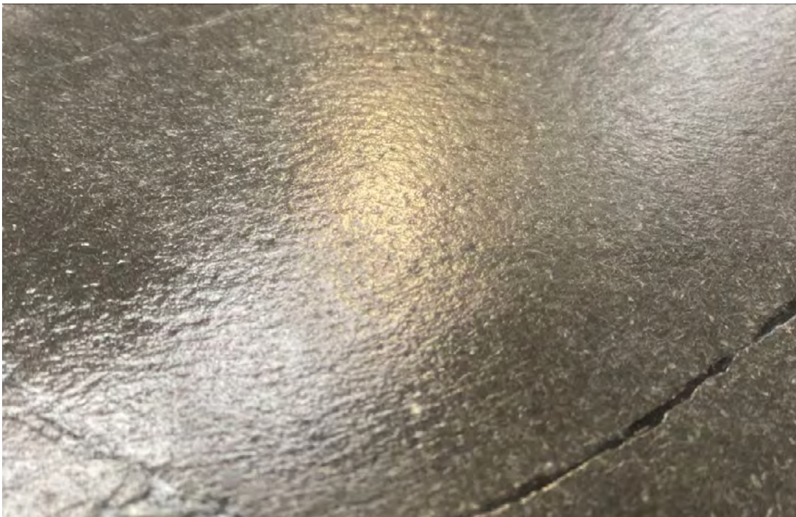
Close up of Negresco Quartzite