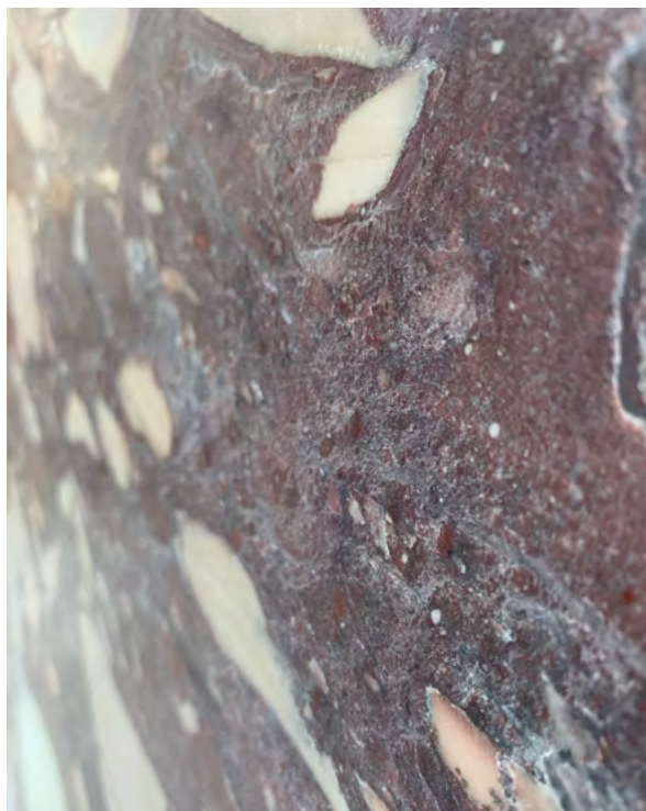
Close up of Calacatta Viola