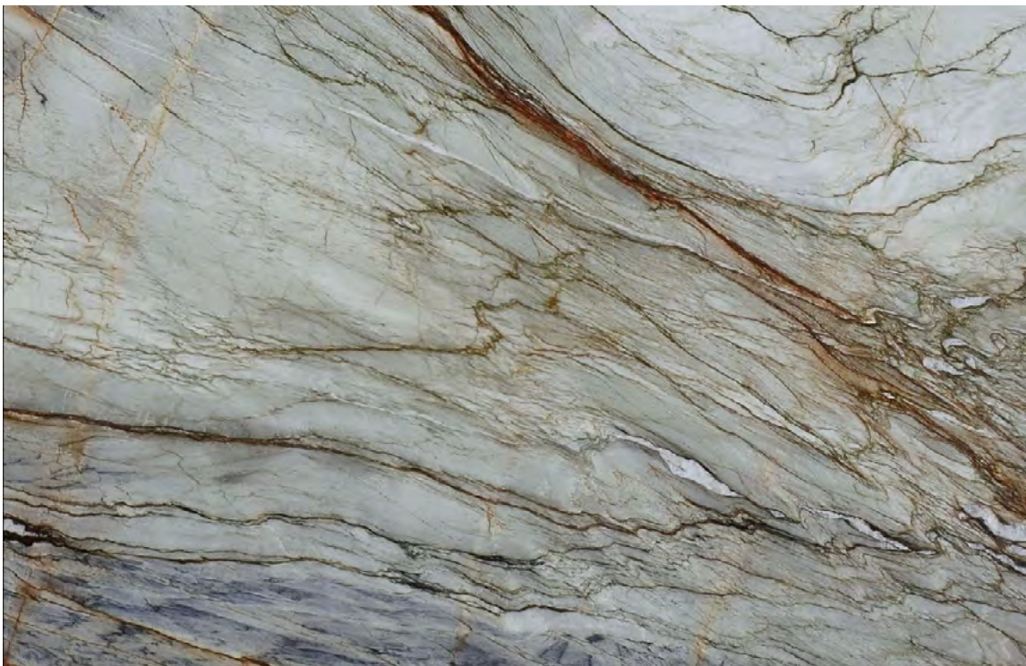
Close up of Tempest Blue Quartzite