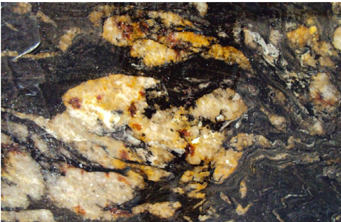
Close up of Titanium Gold