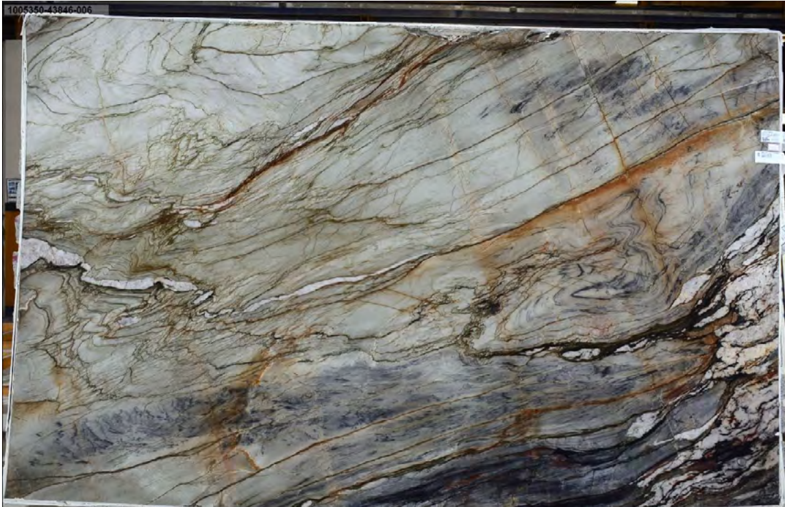
Full slab image of Tempest Blue Quartzite

With subtle blues and warm tones this stunning quartzite material will turn heads wherever it lands in your next project!!