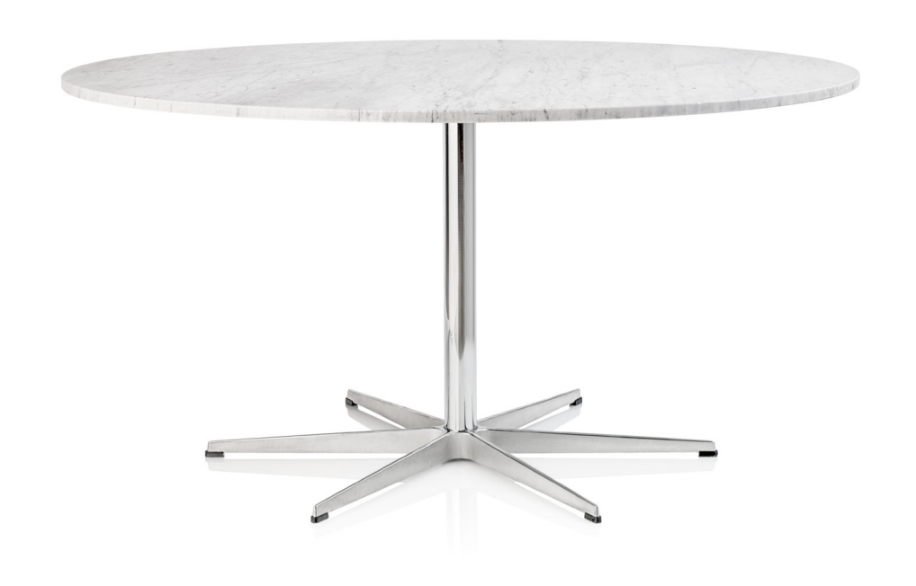
REPUBLIC OF Fritz Hansen®