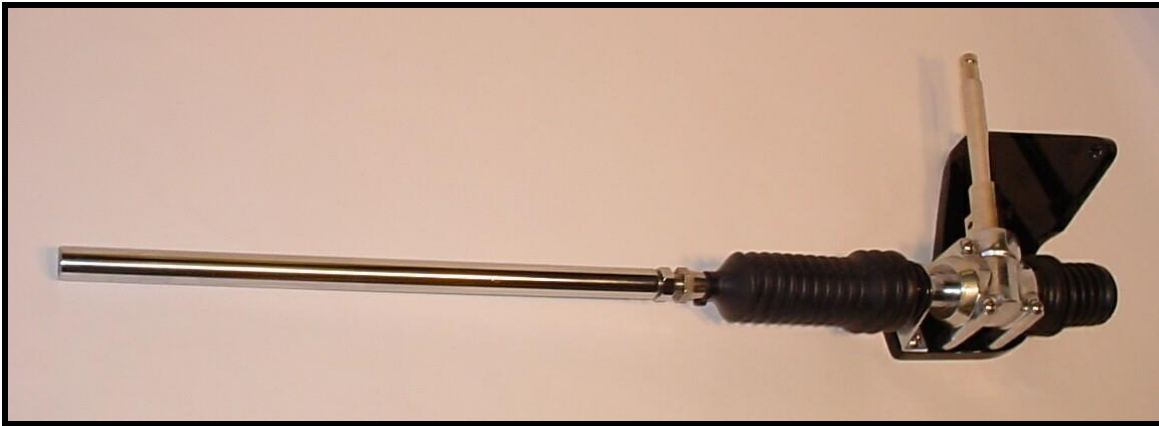
8000470-01 (shown above with Vega Replacement Shaft)

Due to variables outside our control these kits may not fit all applications. Also, please verify kit will fit your application before altering vehicle.