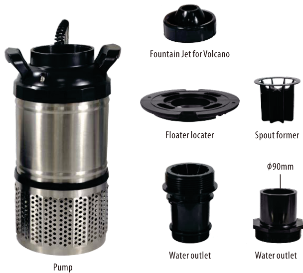
Total Height: Meter