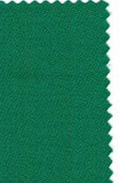
Simonis 760" The Original Worsted Blend Shown in Simonis Green<sup>Th</sup>