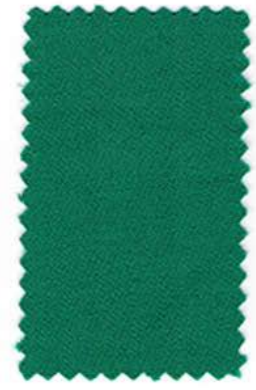
Simonis 860 HR™ High-Resistant Commercial Cloth Shown in Simonis Green TH