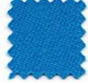
Tournament Blue **