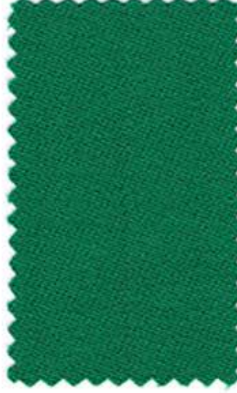
Simonis 860" The New Standard for Pool Shown in Simonis Green™