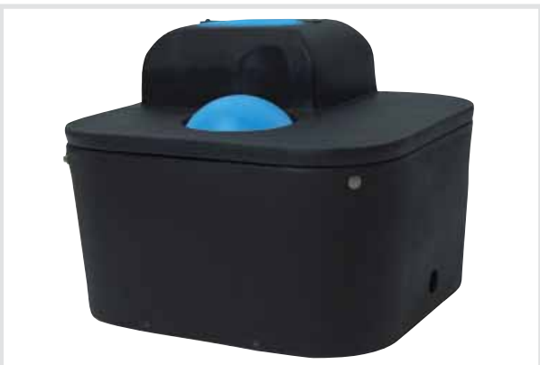
MiraFount A3330 Energy Free