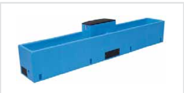
BigSpring A6400 Energy Efficient

Tough, high impact resistant, Rockite construction. Removable dome for fast and easy access to valve area. Sloped bottoms for easy cleaning. Optional 500 watt submersible heater sold separately.