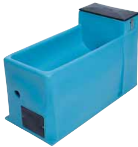
Lil'Spring A3200 Energy Efficient

Designed with a heavy duty polyethylene construction for beef and dairy cattle, this open waterer maintains high impact resistance for tough conditions. Installs easily on most existing concrete pads. 3" offset drain. Optional 250 watt submersible heater sold separately.