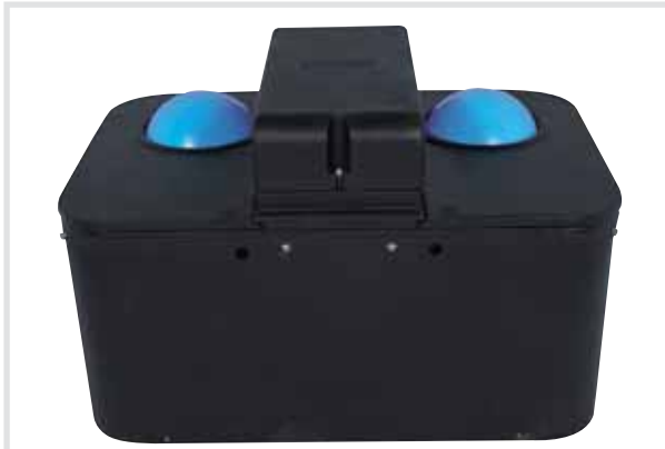
MiraFount A3390 Energy Free