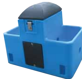
Lil'Spring A2700 Energy Efficient

Resistant to corrosion, the double sided Lil'Spring Goat & Sheep Waterer has no sharp edges. Optional 250 watt submersible heater sold separately.