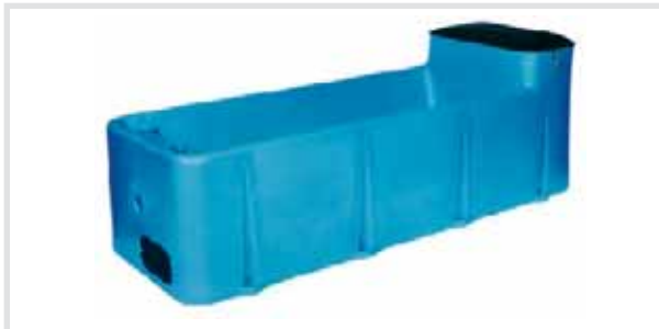
BigSpring A6000 Energy Efficient

For cleaner water, neck rail recommended to prevent cattle from standing in the water.