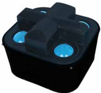
MiraFount A3340 Energy Free