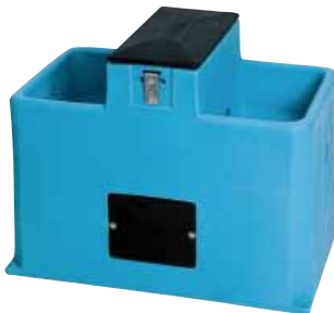
Lil'Spring A3100 Energy Efficient

Large panels for easy tool free access to valve area. This double sided open waterer is resistant to corrosion, with no sharp edges. Optional 250 watt submersible heater sold separately.