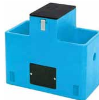
Lil'Spring A2900 Energy Efficient

This double sided waterer is designed with heavy duty polyethylene construction. Optional 250 watt submersible heater sold separately.