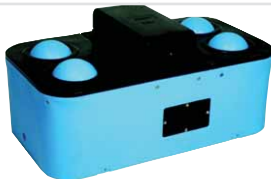
E-Fount A3354-SE Energy Efficient: 2 - 75 Watt Heat Elements

This MiraFount 4 Hole Waterer has top panels that can be easily removed to help get new cattle started fast. Or, remove the panels to provide more capacity for a few extra head. Stainless steel anchor bolts are included.