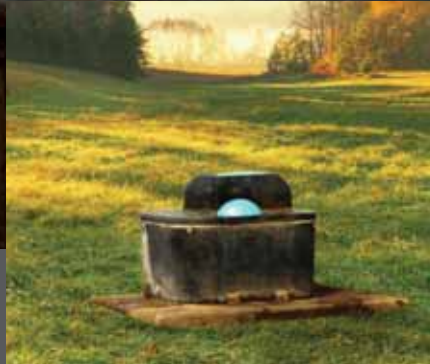
Poly construction makes these tanks durable. Multiple color options available on select tanks