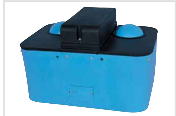
E-Fount A3390-E Energy Efficient: 75 Watt Heat Element

The MiraFount 2 - Hole Waterer has split top panels that can be easily removed to help get new cattle started fast. Or, remove the panels to provide more capacity for a few extra head. The openings are 10" with 10.75" ball closures. Stainless steel anchor bolts are included.