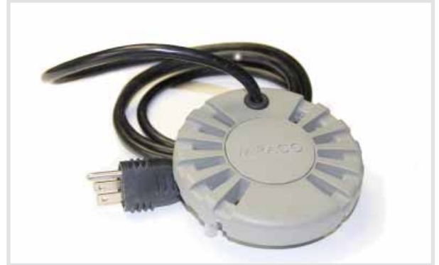
Heaters 1 Year Warranty

Available in 110 Volt or 220 Volt; 250 Watts and 500 Watts. Design allows heater to set .5" above the bottom of the tank for better heat dispersion.