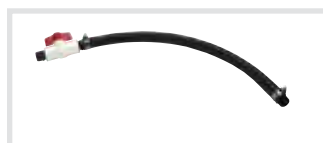
Hookup Kit A158

2' Rubber hose (200 psi) with a shut off valve.