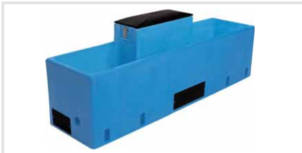
BigSpring A6200 Energy Efficient

Tough, high impact resistant, Rockite construction. Removable dome for fast and easy access to valve area. Sloped bottoms for easy cleaning. Optional 500 watt submersible heater sold separately.