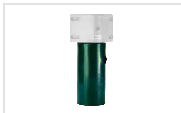
EquiFount A834-5 Insulated Extension Tube

Cold barns are not a problem for EquiFount Waterers. This insulated extension tube allows the water line to enter from below without freezing. Rubber plug may be removed for access to water shut off valve.