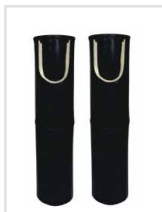
Insulated Heat Tube A834

Easy to install underground shut off kit. Has drain back.