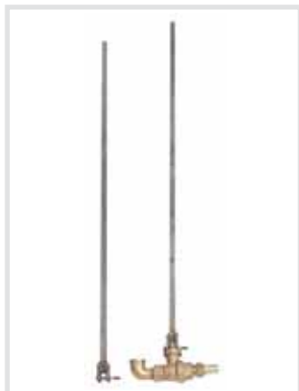
Underground Shut Off Kit A399-5

Easy to install underground shut off kit. Has drain back.