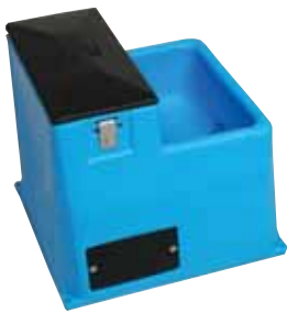
Lil'Spring A3000 Energy Efficient

This single sided open waterer is resistant to corrosion, with no sharp edges. Access panels at both ends.