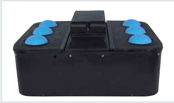
MiraFount A3370-S Energy Free

250 Head Beef | 120 Head Dairy 200 Cow/Calf Units