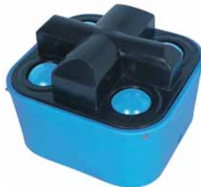
E-Fount A3340-E Energy Efficient: 75 Watt Heat Element

This MiraFount 4 Hole Waterer is designed specifically for sheep. Stainless steel anchor bolts are included.