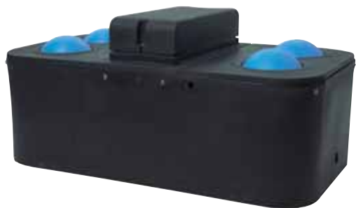
MiraFount A3354 Energy Free