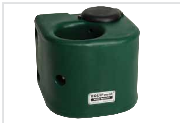
EquiFount A1200 Wall Mount

Automatic 1 Gallon Wall Mount Waterer available with optional heater. EquiFount features smooth rounded edges for safety with minimum intrusion on stall space.