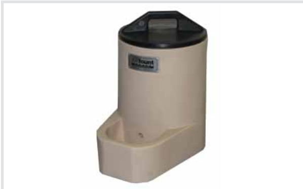
Lil'Fount A1000 Multipurpose Waterer

The Lil'Fount pet waterer features all polyethylene construction with polyurethane foam insulation. It's poly exterior makes cleaning a breeze. There is no buildup of bacteria or algae. The bowl refills automatically, with no moving parts.