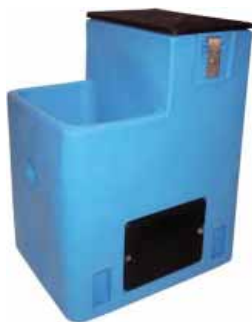
Lil'Spring A2800 Energy Efficient

Resistant to corrosion, the Lil'Spring Multipurpose Waterer has no sharp edges. Optional 250 watt submersible heater sold separately.