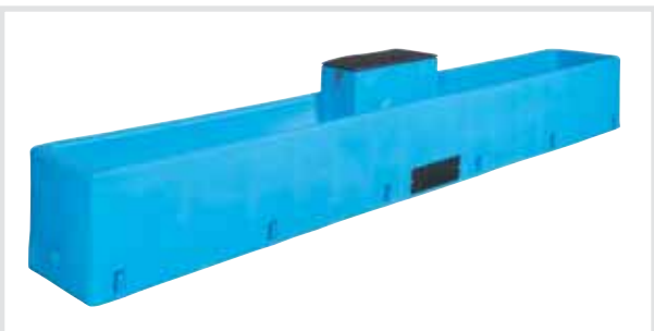
BigSpring A6500 Energy Efficient

Tough, high impact resistant, Rockite construction. Removable dome for fast and easy access to valve area. Sloped bottoms for easy cleaning. Optional 500 watt submersible heater sold separately.