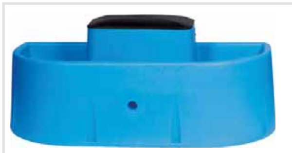
BigSpring A6100 Energy Efficient

This tank is a favoured by Dairies. Flat back sits flush with wall. Removable dome for easy access to valve area. Optional 500 watt submersible heater sold separately.