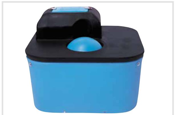
E-Fount A3330-E Energy Efficient: 75 Watt Heat Element

The MiraFount 1 - Hole Waterer has split top panels that can be easily removed to help get new cattle started fast. The opening is 8.75" with a 9" ball closure. Stainless steel anchor bolts are included.