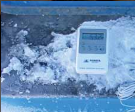
Miraco tanks can withstand cold temperatures without freezing

When you see the water balls you know you have water - even from a distance.