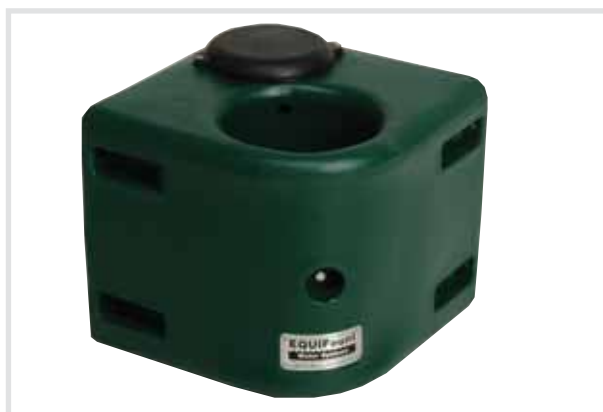
EquiFount A1100 Corner Mount

Space-saving corner mount waterer available with optional heater. Holds 1 gallon of water. Automatic waterer.