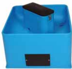
Lil'Spring A3500 Energy Efficient

Resistant to corrosion, the Lil'Spring Multipurpose Waterer has no sharp edges. Access panels are located at both ends of the tank. The diagonal valve compartment lets more cattle drink at one time. Optional 500 watt submersible heater sold separately.