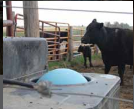
Patented Miraco roll-away ball closures