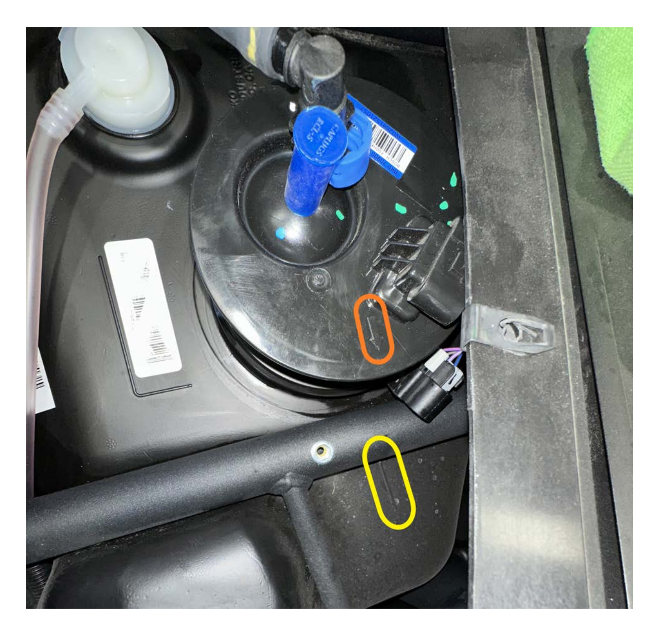
#8 Install fuel line and wiring plug being sure to re-clip the gray portion of the electrical plug and blue clip of the fuel line.

#9 Reinstall fuel pump metal cover, plastic trim pieces, and glove box cover.