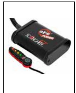
SCORCHER GT Module