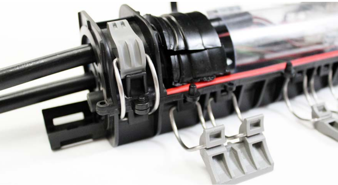
02 Bespoke cable retention and sealing system