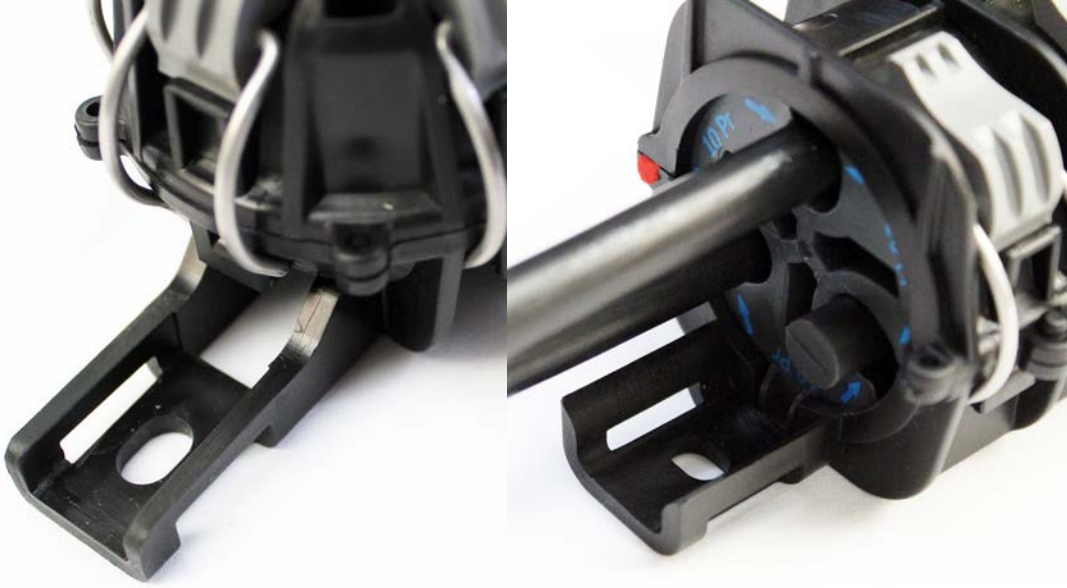
07 Integrated mounting brackets for walls, poles or UG joint box no.2