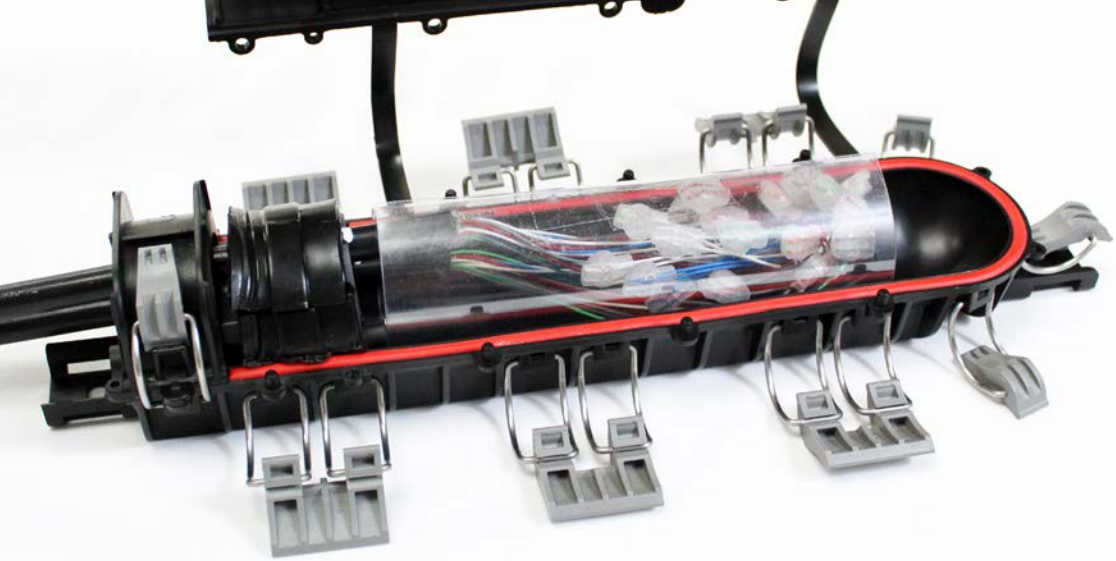
01 Closure suitable for construction or maintenance