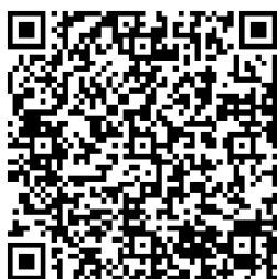
(Android QR Code)