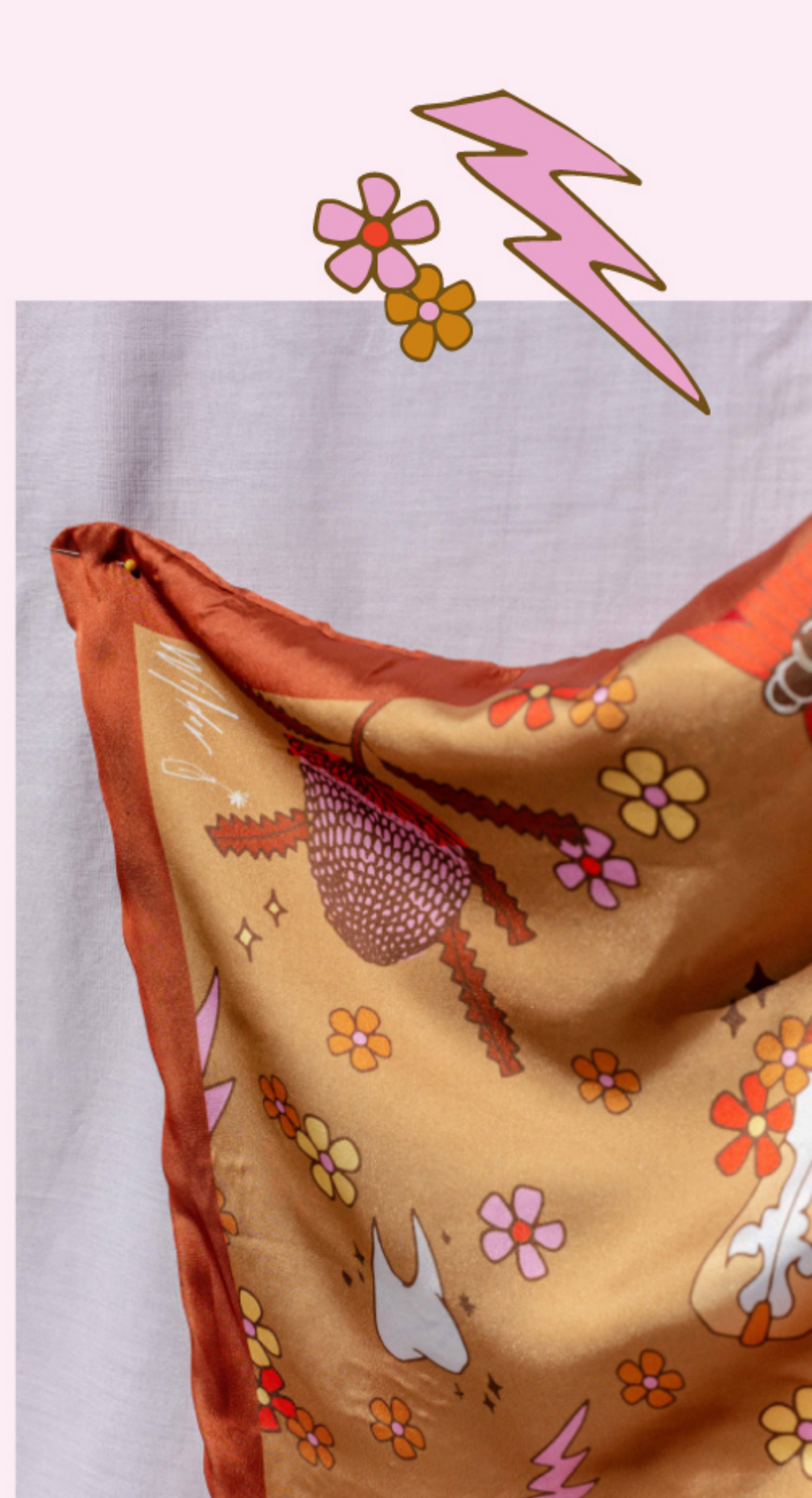
Wilder Studio Textiles | 2021 The Scout Scarf.