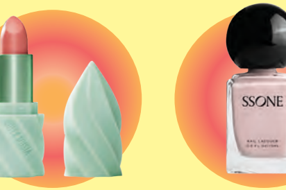
SSONE Nail lacquer, $25, ssoneny.com.