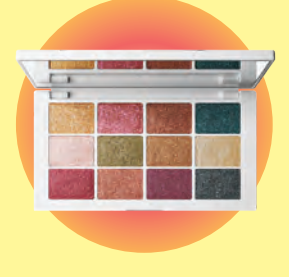
MAKEUP BY MARIO Master Metallics eye shadow, $50, makeupbymario.com.