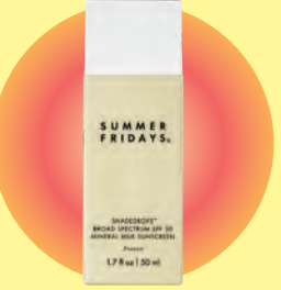
SUMMER FRIDAYS ShadeDrops sunscreen, $36, summerfridays.com.