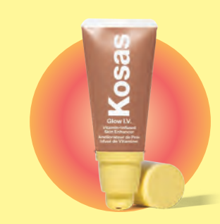
KOSAS Glow I.V. skin enhancer, $38, sephora.com.