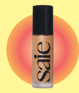
SAIE Glowy Super Skin highlighter, $40. saiehello.com.