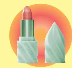
QUEEN MUSIA Matte cream lipstick. $25, queenmusia.com