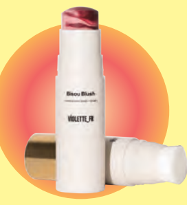
VIOLETTE FR Bisou blush, $35, violettefr.com.