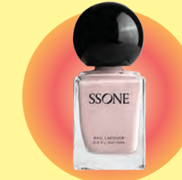
SSONE Nail lacquer, $25, ssoneny.com.