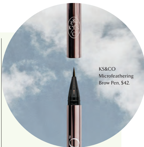
KS&CO Microfeathering Brow Pen, $42.