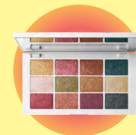
MAKEUP BY MARIO Master Metallics eye shadow, $50, makeupbymario.com.