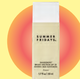
SUMMER FRIDAYS ShadeDrops sunscreen, $36, summerfridays.com.