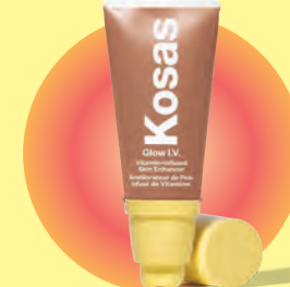
KOSAS Glow I.V. skin enhancer, $38, sephora.com.