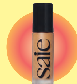
SAIE Glowy Super Skin highlighter, $40, saiehelloworld.com.