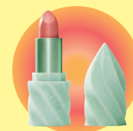
QUEEN MUSIA Matte cream lipstick, $25, queenmusia.com.