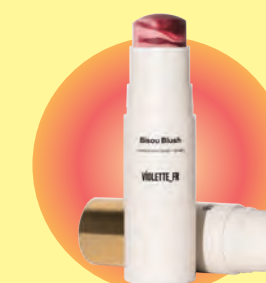
VIOLETTE_FR Bisou blush, $35, violettefr.com.