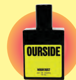
OURSIDE Moon Dust eau de parfum, $79, outside.nyc.