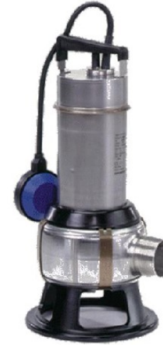
SEWAGE PUMP GRUNDFOS UNILIFT AP50B.50.08.A1.V 230V 50Hz 5.37 Amp

EARTH NEUTRAL LIVE MAINS SUPPLY 230V 50Hz