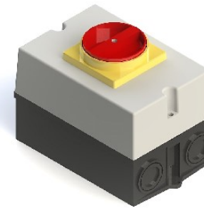
ISOLATOR LOVATO GAZ016 16 Amp