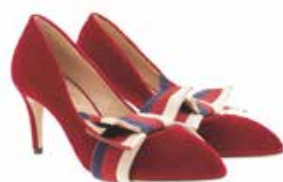
Gucci Velvet Pumps £371 www.fashionette.co.uk