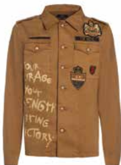
La Martina Military Jacket Sand £215 www.lamartina.com