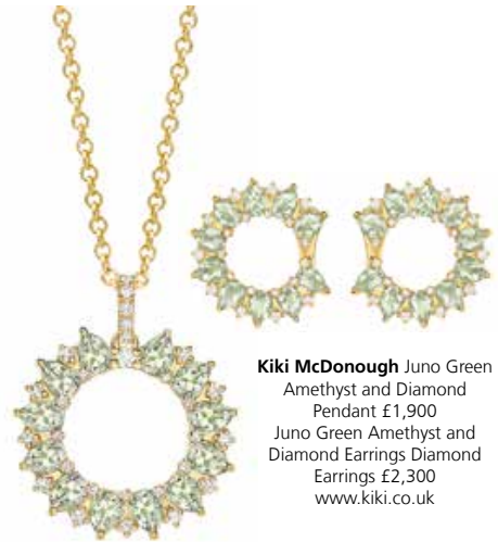
Kiki McDonough Juno Green Amethyst and Diamond Pendant £1,900 Juno Green Amethyst and Diamond Earrings £2,300 www.kiki.co.uk