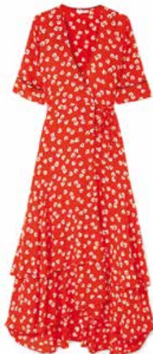
Ganni Floral-print crepe de chine wrap dress £220 www.ganni.com