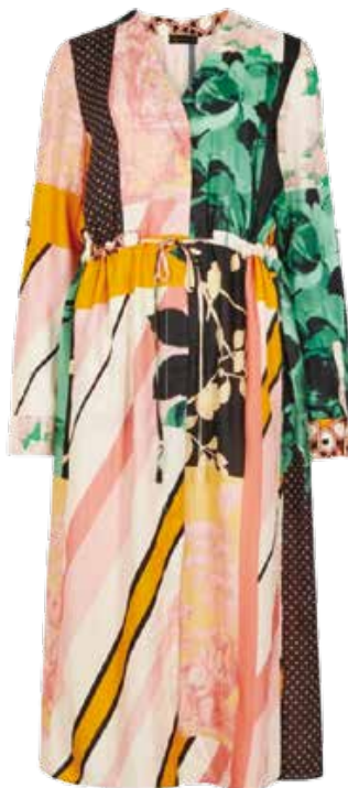
Stine Goya Camilla printed satin-twill dress £280 www.net-a-porter.com