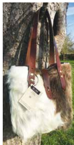
Robson & May Cowhide Tote Bag From £95 www.robsonandmay.co.uk