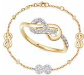
Kiki McDonough Amity Diamond Yellow and White Gold Ring with Intertwined Knot Detail £1,100 Amity Diamond Multiple Knot Bracelet £1,700 www.kiki.co.uk