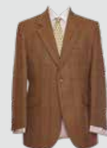
Barrington Ayre Bespoke Tweed Jacket From £595 www.barringtonayre.co.uk