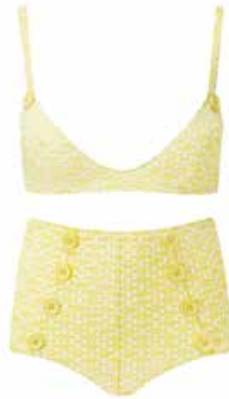
Lisa Marie Fernandez Magdalena Yellow Two-Tone Button Bikini £302 www.lisamariefernandez.com