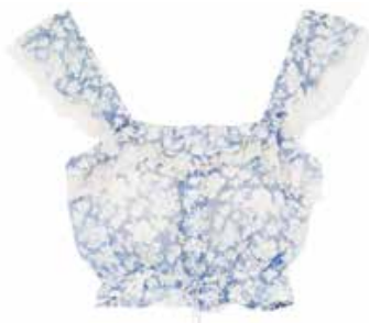
Loveshackfancy Mia Ruffled Print Cotton and Silk-Blend Voile Top £235 www.net-a-porter.com