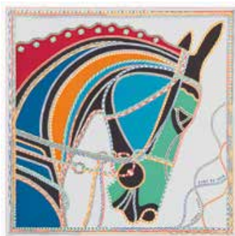
Hermes Robe du Soir Scar 90 £330 www.hermes.com