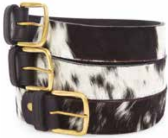
Jambo Collection Cowhide Belt £45 www.thejambocollection.co.uk