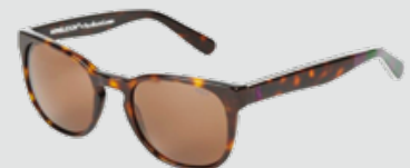
Wimbledon Ralph Lauren Dark Havana Sunglasses £111 shop.wimbledon.com