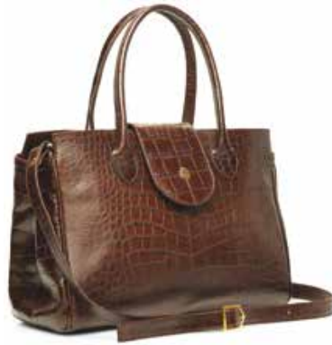
Fairfax & Favor The Langley Chocolate Croc Print £395 www.fairfaxandfavor.com