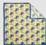
Sir Plus Sir Plus x Rose Electra Harris Pocket Square £45 www.sirplus.co.uk