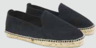
Manebi Hamptons Espadrilles £80 www.manebi.eu