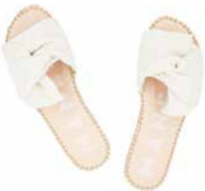
Manebi Yucatan Cream Sandals £98 www.manebi.eu

We are set for a scorcher! With the mercury rising to the thermometer's loftiest heights, we have compiled the best summer fashion to keep you looking and feeling cool, calm and collected as the chukkas hot up.