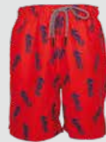
James Cromwell Red Bold Seahorse Swim Shorts £45 www.jamescromwell.co.uk