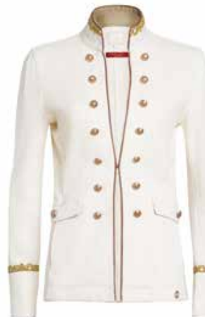
La Martina Royal Box Interlock Jacket £215 www.lamartina.com