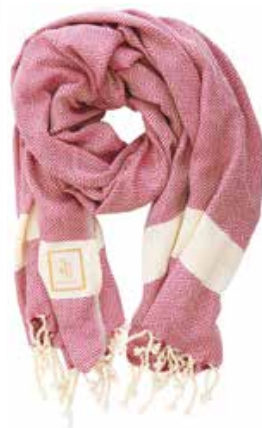
Stick & Ball Cotton Scarf £50 www.stickandballco.com