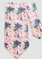
Sir Plus Sir Plus x Rose Electra Harris Tie £95 www.sirplus.co.uk