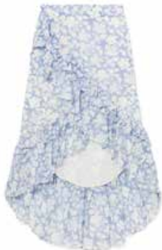
Loveshackfancy Mia Ruffled Print Cotton and Silk-Blend Voile Skirt £330 www.net-a-porter.com