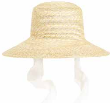
Clyde Medium Brim Flat Top Hat £212 www.clyde.world