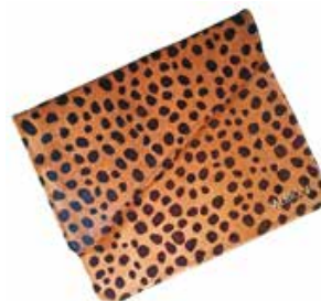
Albion England Anna Clutch £179 www.albionengland.co.uk