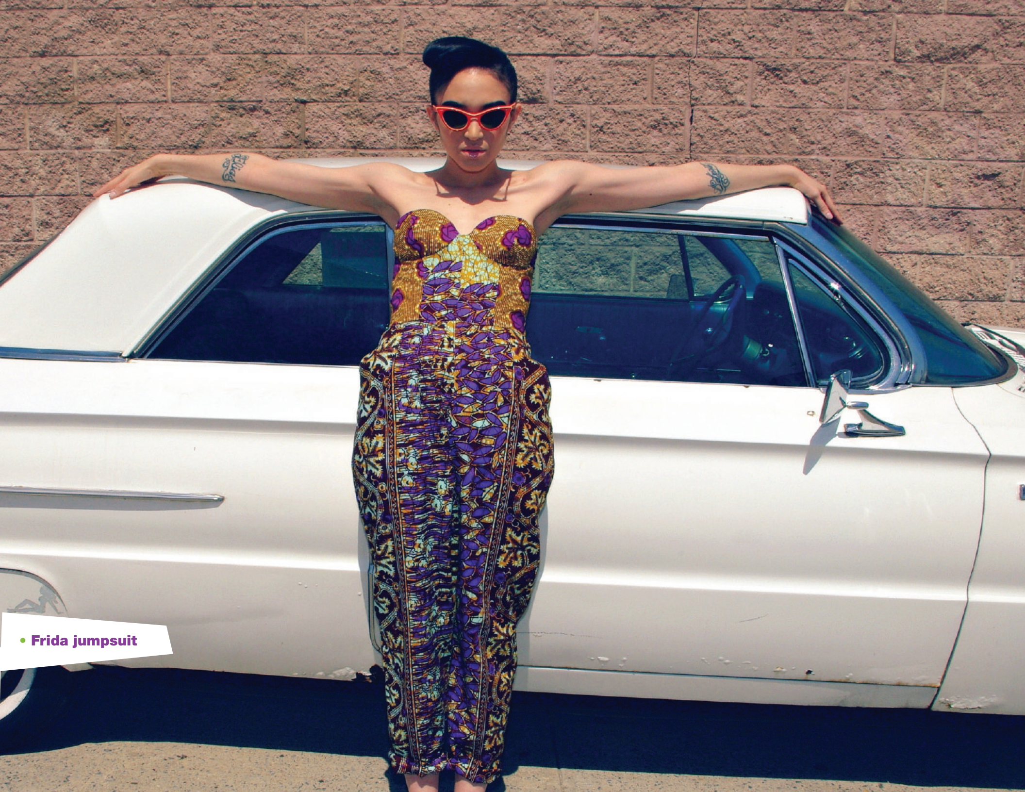
• Frida jumpsuit