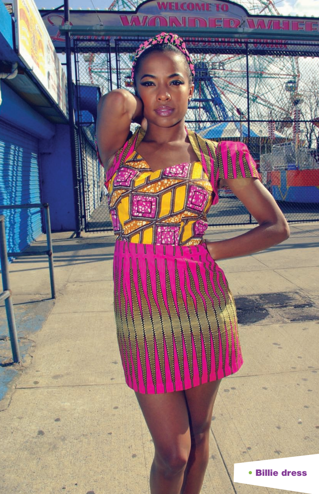
• Billie dress