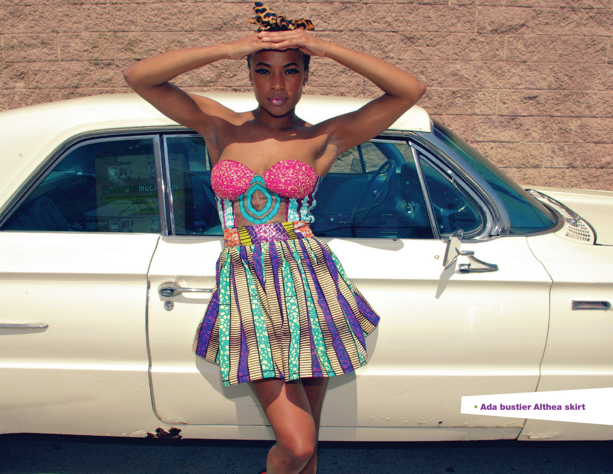
• Ada bustier Althea skirt