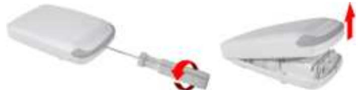
Figure 2: Removing the Top Cover