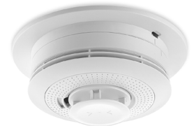
COVERPLATE shown with PROSIXSMOKEV