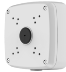
PFA121 Junction box