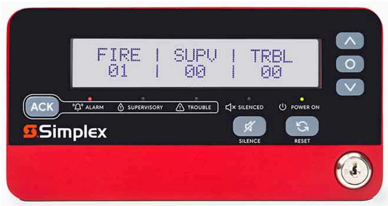
Figure 4: LCD Annunciator