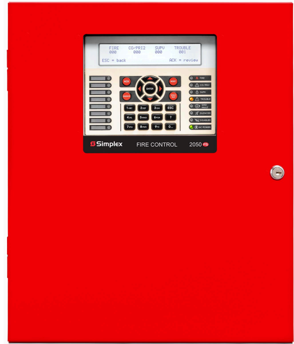
Figure 1: 2050 FACU front view