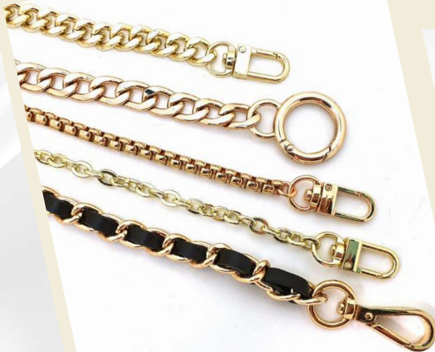
Part 2: Chains