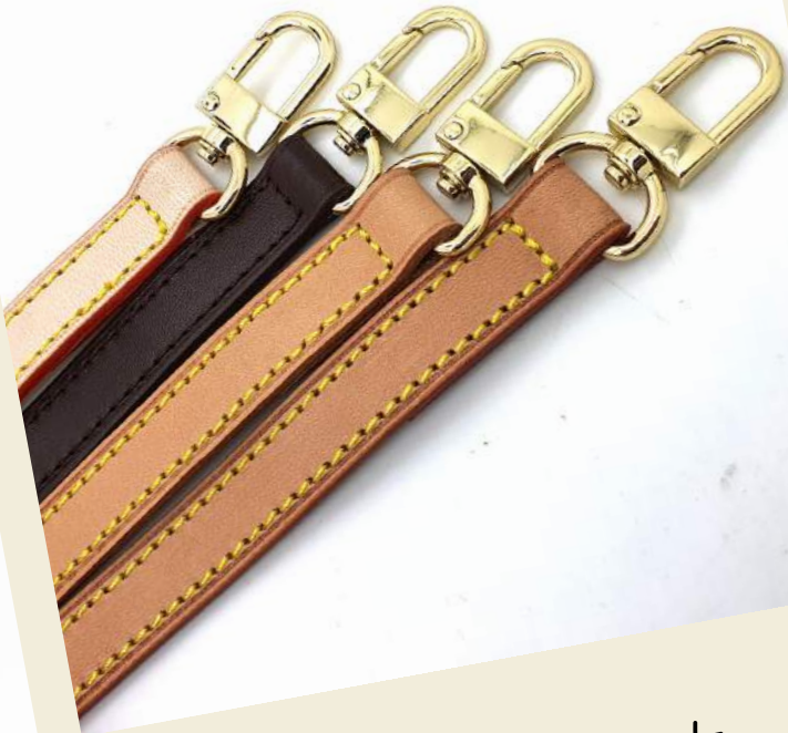
Part 1: Leather Straps