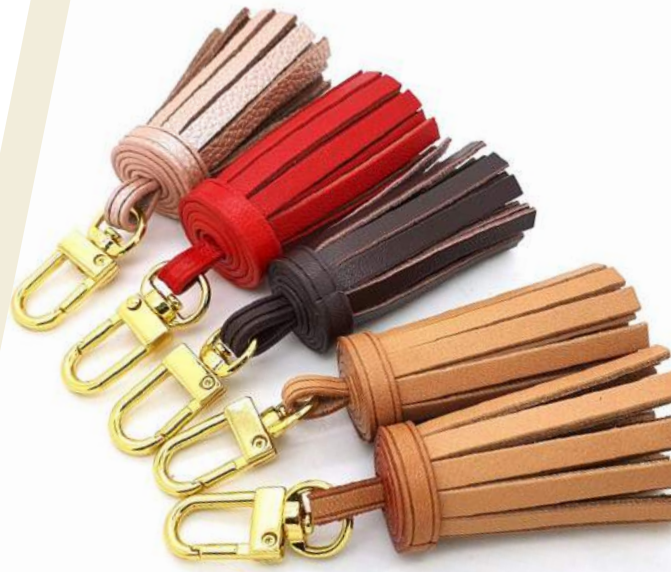
Part 3: Accessories