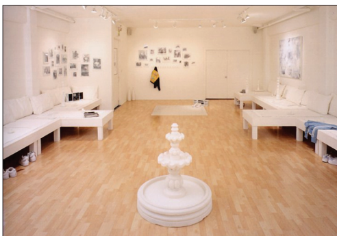
Ala Ebtekar, Elemental , 2004. Mixed media. Dimensions variable (total of 156 \times 180 inches footprint area; two benches; 60 \times 60 inches linoleum floor; a counter/table with sculptural elements). Collection of the artist.