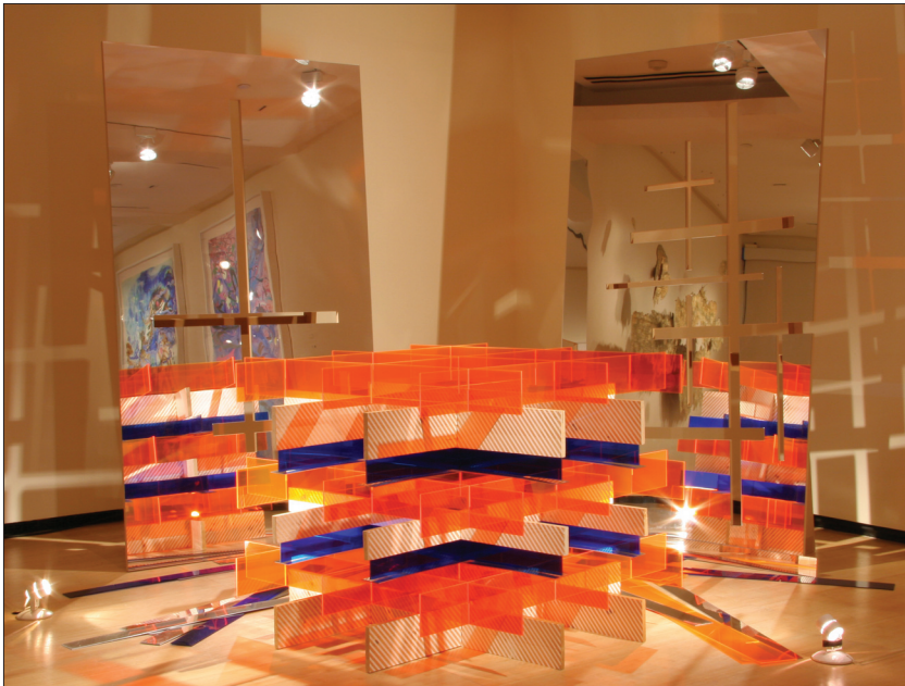
Mika Tajima, Extruded Plaid (Suicidal Desires) , 2006. Plexiglass, MDF, wood, silkscreen, lights, performance.