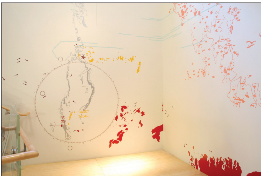
Geraldine Lau, Information Retrieval, #125 , 2006. Vinyl. Adjacent walls along stairwell, each wall about 11 ft × 14 ft. Asia Society, New York City.