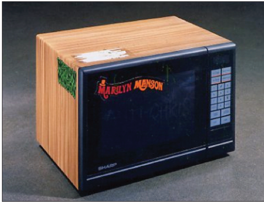
Kaz Oshiro, Microwave Oven #1 (Marilyn Mason) , 2003–04. Acrylic and bondo on stretched canvas. 15 \frac{3}{4} \times 23 \frac{1}{8} \times 16 inches. The Paul Rusconi Collection, Los Angeles.