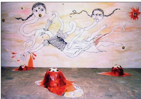
Chitra Ganesh, Sisters , 2005. Mixed media. Approx. 120 \times 240 \times 144 inches. Collection of the artist.