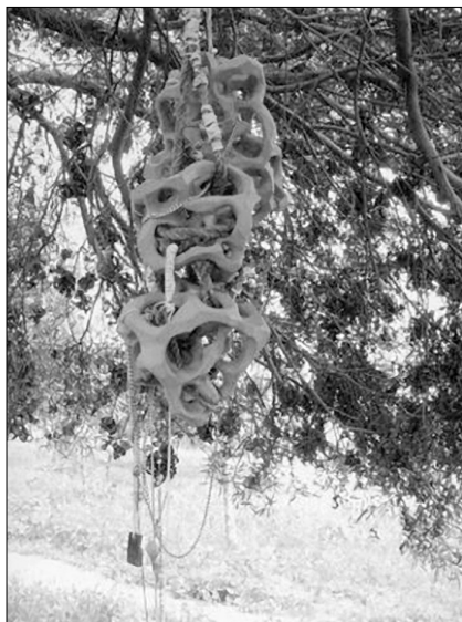
Photo 6.6: Anna Sew Hoy, Violet Noir , 2004. Fired ceramic, rope, beads, charms. Dimensions variable, approx. 14 × 20 × 13 inches (ceramic piece). Collection of the artist.

these two artists do not hesitate to cross the boundaries of their own ethnicities in their works. Their passion for their work has overcome the essentialist notion that the traditional arts of a minority group are only ‘authentic’ when produced by members of that minority.