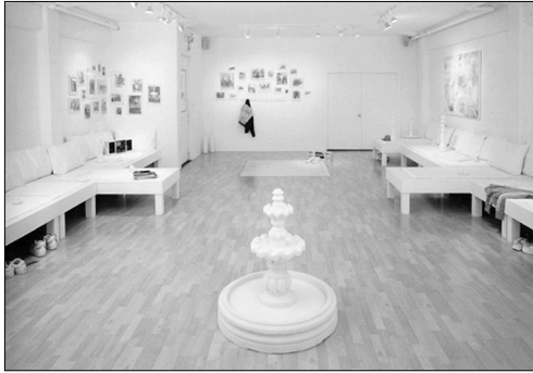
Photo 6.12: Ala Ebtekar, Elemental , 2004. Mixed media. Dimensions variable (total of 156 × 180 inches footprint area; two benches; 60 × 60 inches linoleum floor; a counter/table with sculptural elements). Collection of the artist.

it's still not clear, because I grew up here. However I still feel as though this is my root, or the framework where everything else exists....And I'm getting to know it better. So I get to know it. So it's kind of a comment on that as well, you know?