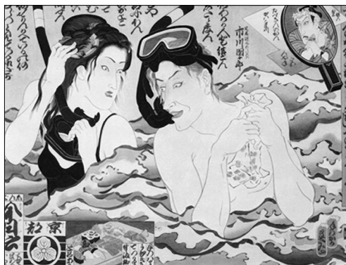
Photo 6.2: Masami Teraoka, Kyoto Woman and Gaijin , from New Waves Series , 1991.

contemporary social problems arising from encounters between ‘Westerners’ and Japanese. In this work, based on interviews with the artist, the curator of the exhibition notes the emotional oscillation of a Japanese female tourist, torn between curiosity and desire toward an American man she encounters on a Hawaiian beach, and the boyfriend waiting for her in Japan.