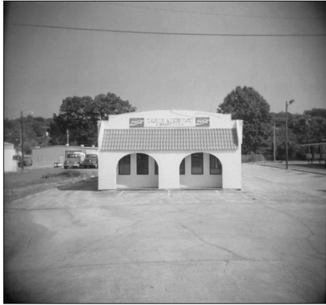
Photo 6.7: Indigo Som, China Garden, Yazoo City, Mississippi (from the series Mostly Mississippi: Chinese Restaurants of the South ), 2004–2005. Digital pigment print. 34 × 34 inches.

She ‘discovered’ the restaurant in the photograph when she was driving through the South. These Chinese restaurants, melded into the landscape of their faraway region, seemed to represent the experiences of the Chinese Americans who have taken root all over the US, after integrating into American society.