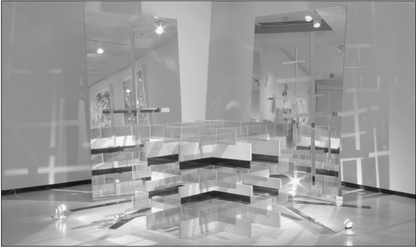
Photo 6.4: Mika Tajima, Extruded Plaid (Suicidal Desires) , 2006. Plexiglass, MDF, wood, silkscreen, lights, performance. Courtesy of the artist.

patterns were placed surrounding the central sculptural element. The piece itself was static, but as visitors walked around it, they could perceive changes in the moving shadows and their own multiple shattered reflections created by the lights reflected in the mirror. A speaker was also placed beside it, emitting the sounds of electric guitars in minimal high, medium, and low tones. The three layers of sound would intertwine and overlap, magnifying viewers' perceptions of time and space. Here, the piece attempts to break down the grid structure, the hierarchy of object, and place.