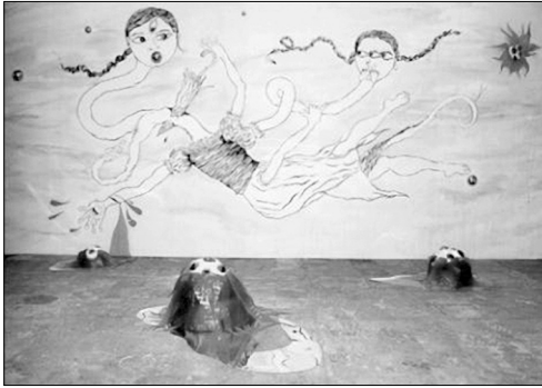
Photo 6.15: Chitra Ganesh, Sisters , 2005. Mixed media. Approx. 120 × 240 × 144 inches. Collection of the artist.

makes it possible for the spectator to perceive their art in its multi-dimensional meanings.