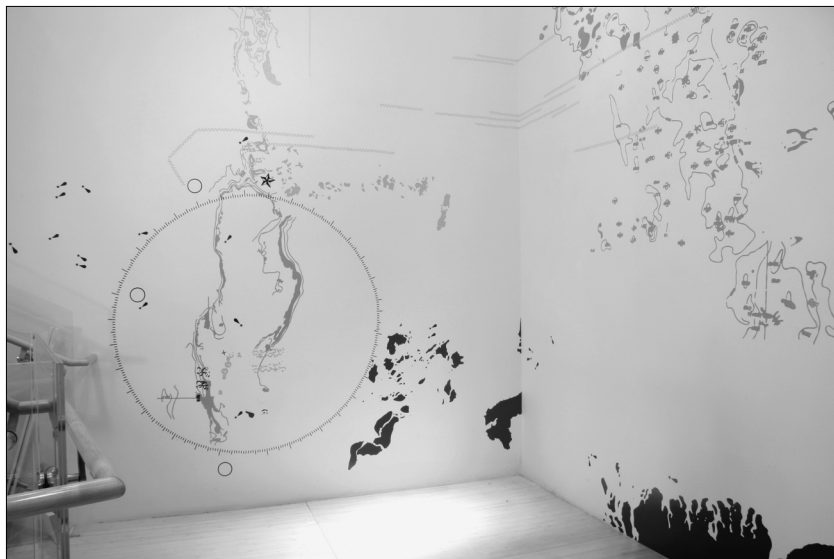
Photo 6.11: Geraldine Lau, Information Retrieval , #125, 2006. Vinyl. Adjacent walls along stairwell, each wall about 11 ft × 14 ft. Asia Society, New York City.

land, orchards, farms, you know. And now everything is exactly like that, like you see. So when you go back, there's this huge sense of dislocation. And that's very much what drives my work. 27