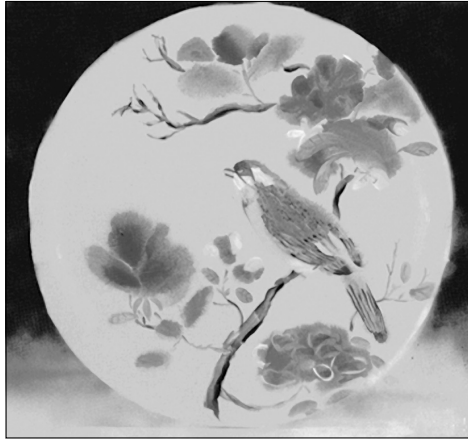
Photo 6.5: Mari Eastman, Bird on Flowering Spray: Porcelain Cup , Chieng-lung Period (1736–1750), 2004. Acrylic on canvas. 40 \frac{1}{2} × 43 \frac{1}{2} inches. Collection of Rosette Delug.

I can claim a feminist identity, a queer identity.’ She has also produced a work incorporating the ‘Dream-catcher,’ a Native American handmade folk object, as well as humorous sculptures inspired by Japanese pop culture, such as one of a giant green wasabi (horseradish).