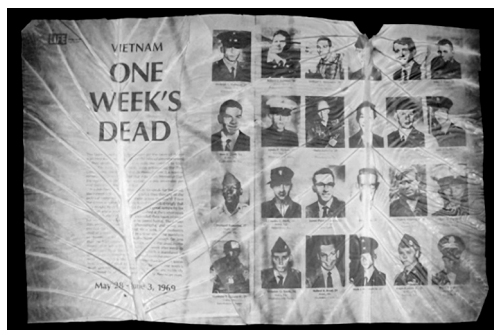
Photo 6.9: Binh Danh, One Week's Dead #1 , from the Life: One Week's Dead Series , 2006. Chlorophyll print and resin. 17 1/2 × 24 inches. Collection of the artist.

the significant difference in 'race' between those who died in the Vietnam War, in contrast to the Iraq War.