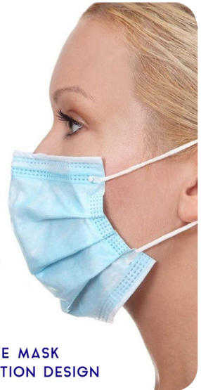
3PLY PROTECTIVE MASK MULTI-LAYER PROTECTION DESIGN