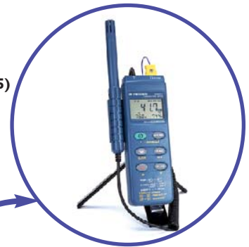
Tripod Mountable (tripod not included)