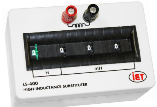
Available from 1 μH to 99.999 99 H (LS-400 Shown)

LS Series: Digital Inductance Substituter