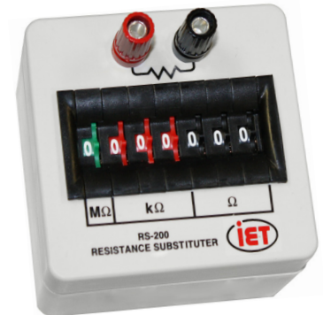
Available from 0.01 Ω to 299,999,999.9 Ω (RS-200 Shown)

RS Series: Digital Resistance Substituter