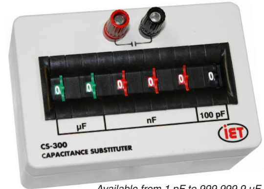
Available from 1 pF to 999.999 9 μF (CS-300 Shown)

CS Series: Digital Capacitance Substituter