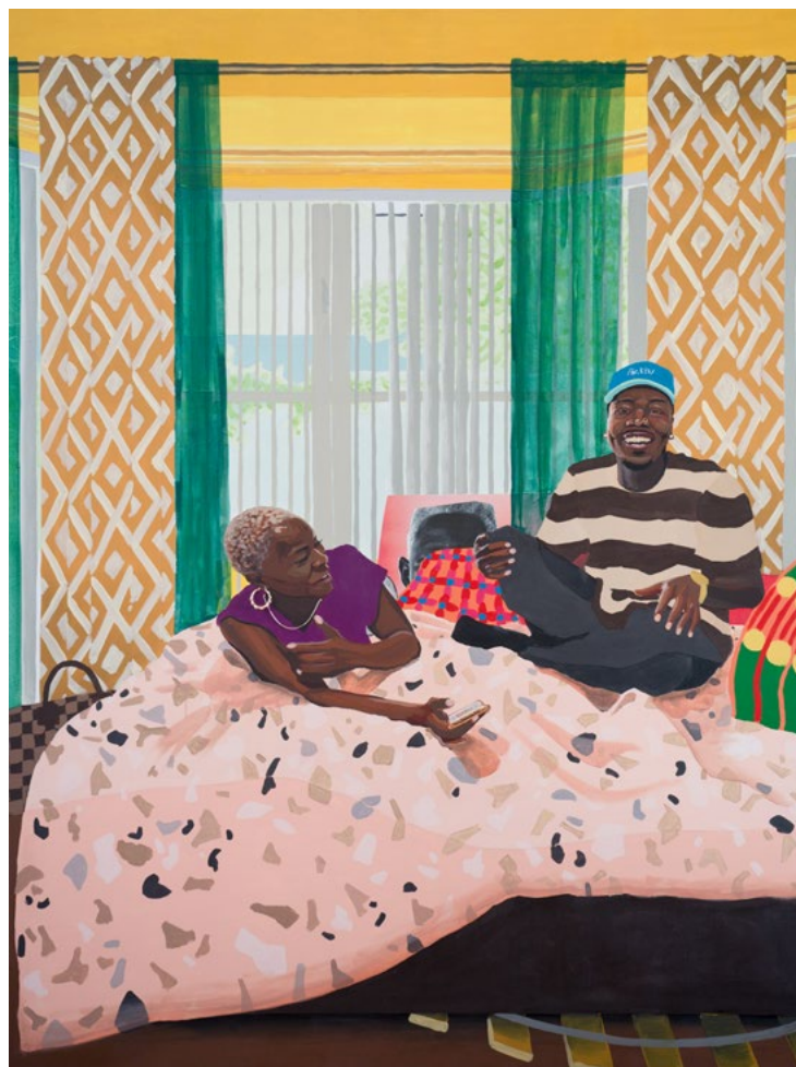
TT, I'M SO DONE WITH YOU Acrylic, swap meet jewelry, and inkjet print on canvas