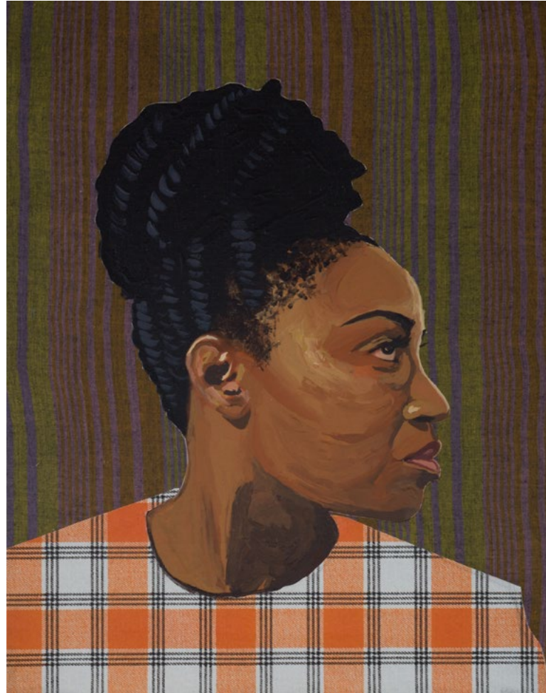
WHITNEY Acrylic, found textile, and Japanese paper on canvas