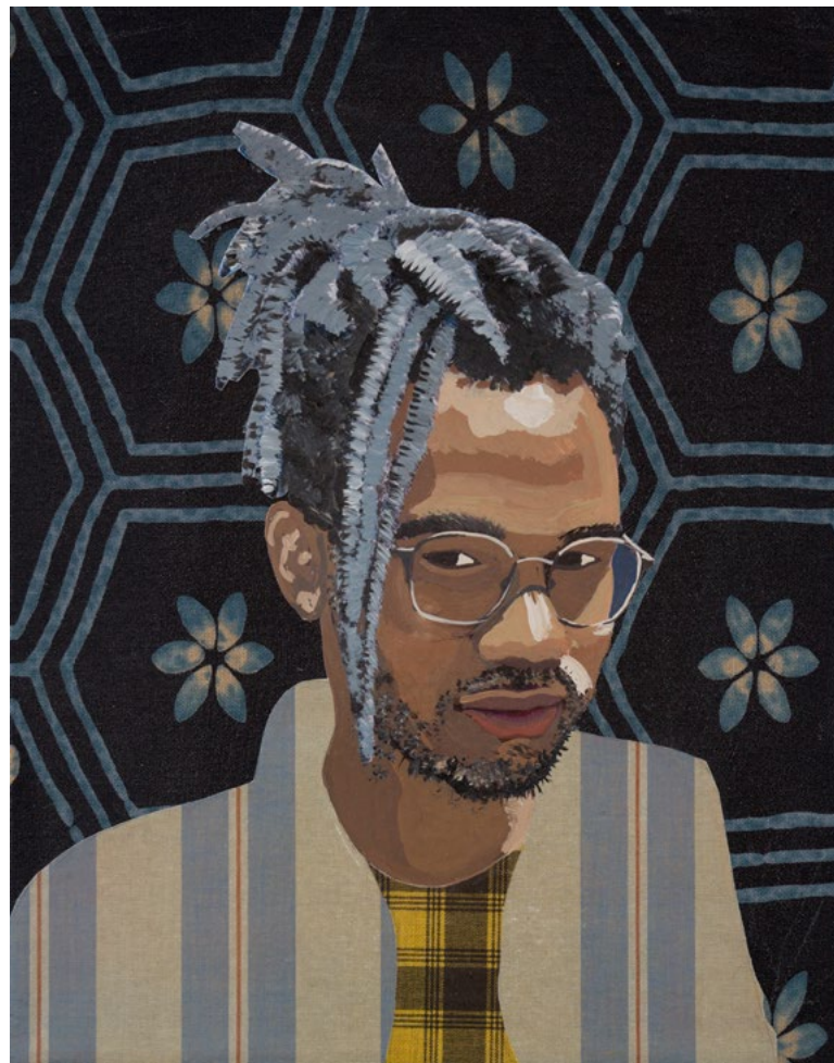
SEBASTIAN Acrylic, found textile, and Japanese paper on canvas