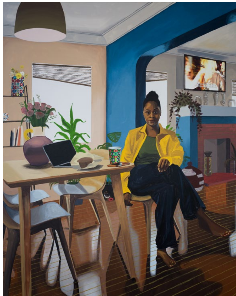
BOOKED AND BUSY Acrylic, pressed flowers, and inkjet prints on canvas