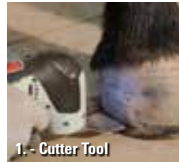
1. - Cutter Tool