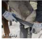
1. - Rasp