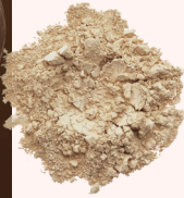
Grace (P1) Available in Loose Mineral Foundation only For very light skin with neutral undertones