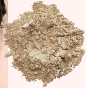
Nurture (Y4) For light – medium skin with neutral undertones