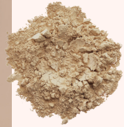
Strength (N3) For light skin with warm undertones