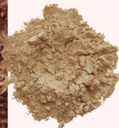
Freedom (N7) For medium – dark skin with golden/red undertones