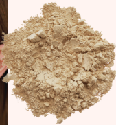
Patience (Y5) For medium skin with warm undertones