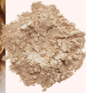
Unity (N2) For light skin with pink undertones