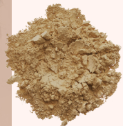
Inspiration (Y8) Available in Loose Mineral Foundation only For medium – dark skin with olive undertones

Our skin caring foundation range is driven by pure performance. These 100% natural & Certified Organic formulas are buildable and blendable, creating a perfected luminous finish.