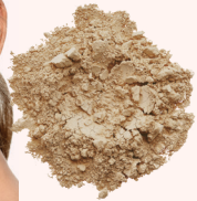
Trust (Y6) For medium – dark skin with golden undertones