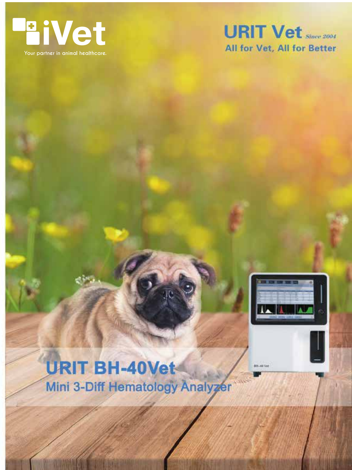
URIT BH-40Vet Mini 3-Diff Hematology Analyzer

URIT Vet Since 2004 All for Vet, All for Better