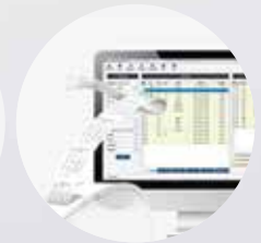
3. Read results