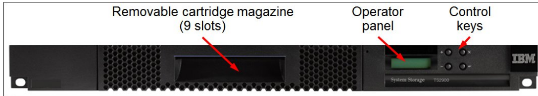
Figure 2. Front view of the TS2900 Tape Autoloader

The following figure shows the front of the TS2900 Tape Autoloader.