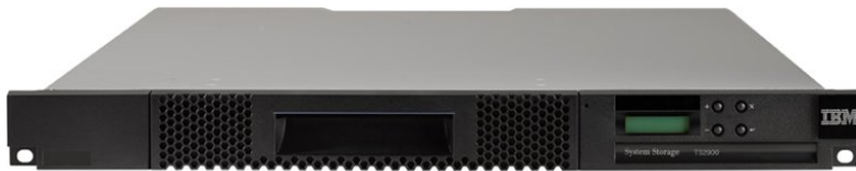
Figure 1. TS2900 Tape Autoloader

The TS2900 is an ideal solution if you need an entry-level larger capacity or higher performance tape backup with or without random access and for tape automation used along with Lenovo servers.