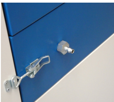
Simple air supply to power filter cleaning