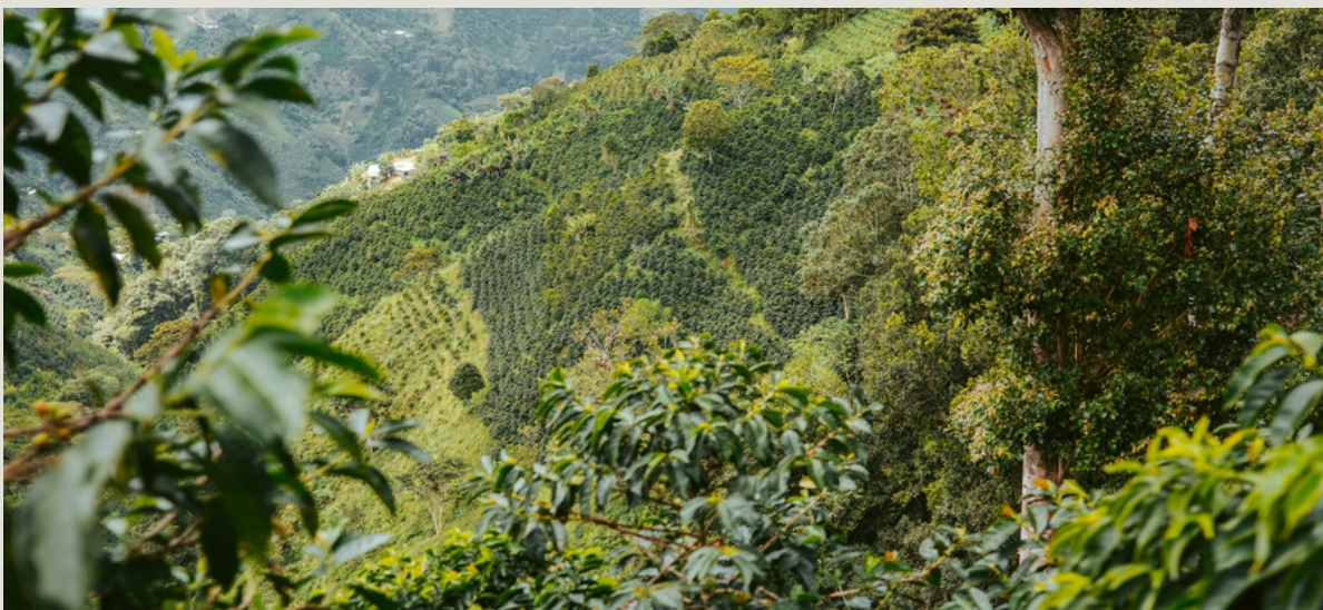
Lubier's Beltran's farm in Palestina, Huila, Colombia