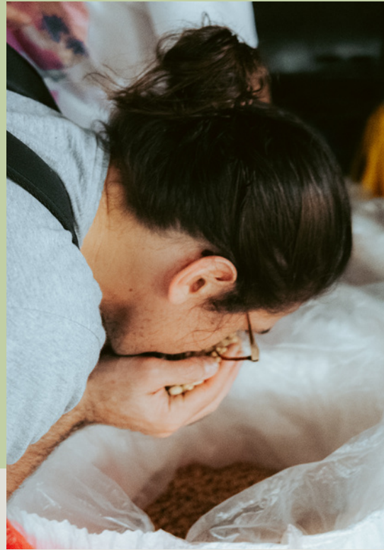
Smelling parchment on Ricuarte Quiacha farm in Garzon, Huila, Colombia

Below you can find the definitions of terms used in our transparency report.