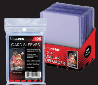
Penny Sleeves & Top Loaders

Once you have secured the cards, you can now proceed to place them in an envelope or box. Include a copy of your Game Addict Submission form. Single Cards can be sent in a Padded Bubble Mailer Multiple cards should be sent in a padded box or similar, that provides the cards with padding during transport.