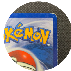
WHITE, DAMAGED EDGES