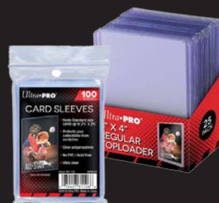
Penny Sleeves & Top Loaders

Once you have secured the cards, you can now proceed to place them in an envelope or box. Include a copy of your Game Addict Submission form. Single Cards can be sent in a Padded Bubble Mailer Multiple cards should be sent in a padded box or similar, that provides the cards with padding during transport.