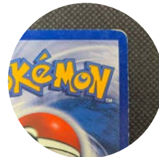
WHITE, DAMAGED EDGES