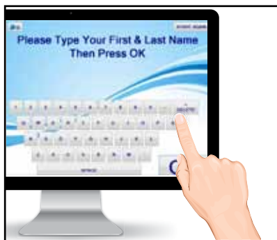
Step 1: Visitor Sign In

Photograph included in the email to know your visitor before you meet them