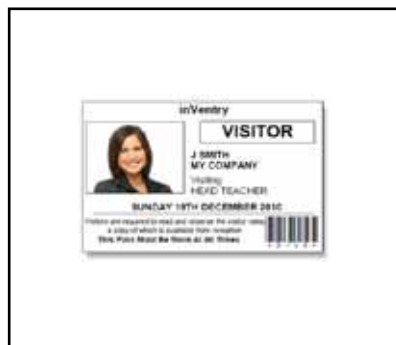
Step 2: Collect Badge