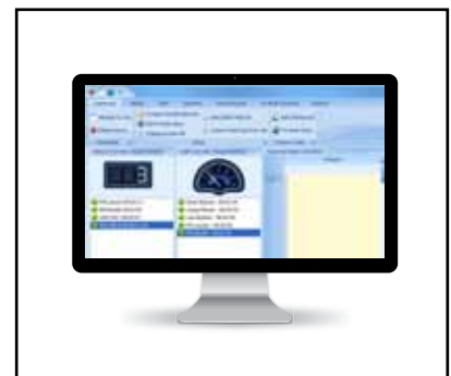
Step 3: Access Your Data