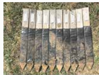
The first samples failed after 8 years