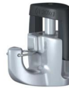
Security Hook (20kg)