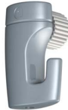
Light Hook (5kg)