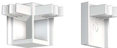
Corner Connector and End Cap Accessories

TIP: For MINI, PRO and GALLERY rails, if the end of the rail is visible, order an "End Cap" to provide a neat and professional finish