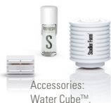
Accessories: Water Cube™, Anticalc Cartridge (optional) and Essential oils

Weight: 5.1 kg / Sound level: 27 – 48 dB(A)