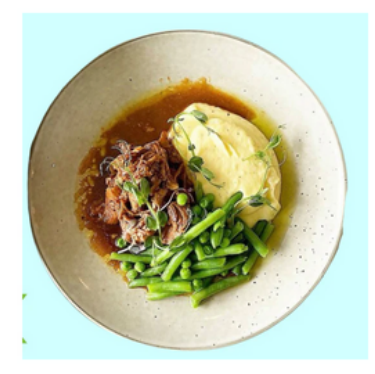
Braised Moroccan Lamb Shoulder with Kumara Mash ✓