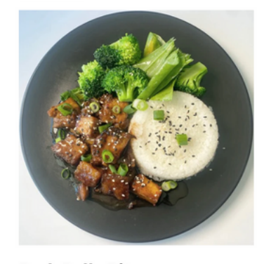
Pork Belly Bites $17.90