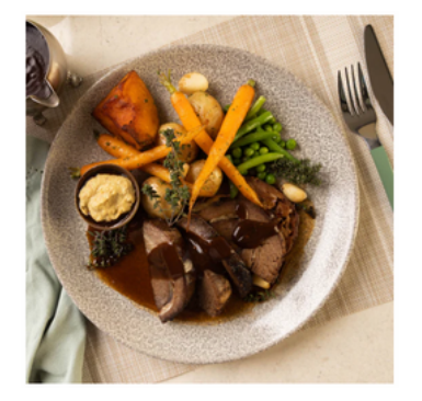
Slow Roasted Beef & Vegetables ✔ $17.90