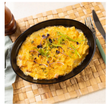
Truffle Mac n Cheese $16.90