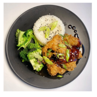
Karaage Crispy Fried Chicken ✔ $17.90