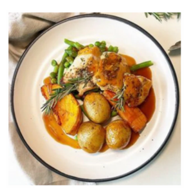
Roast Chicken Breast & Vegetables ✔ $17.90