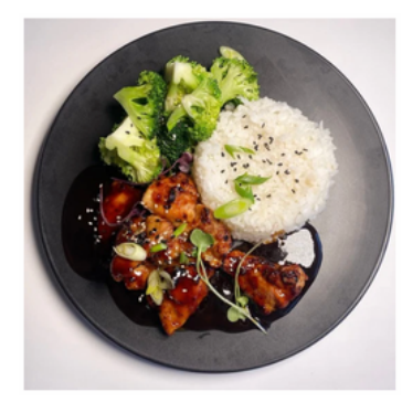
Grilled Chicken Teriyaki ✔ $17.90