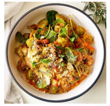
Pumpkin and Ricotta Ravioli (Vego) $17.90