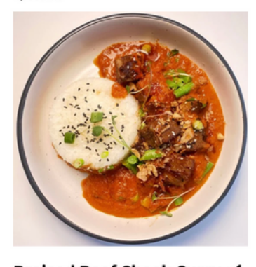
Braised Beef Cheek Curry ✔ $17.90