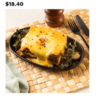
Lasagne with Beef Mince & Cheese $17.90