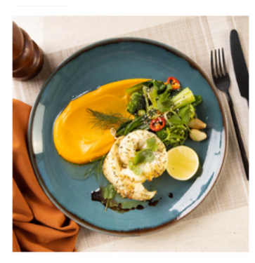
Fish & White Sauce with Kumara Mash ✔ $17.90