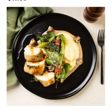
Chicken Breast, Mash, Bacon & Mushroom ✔