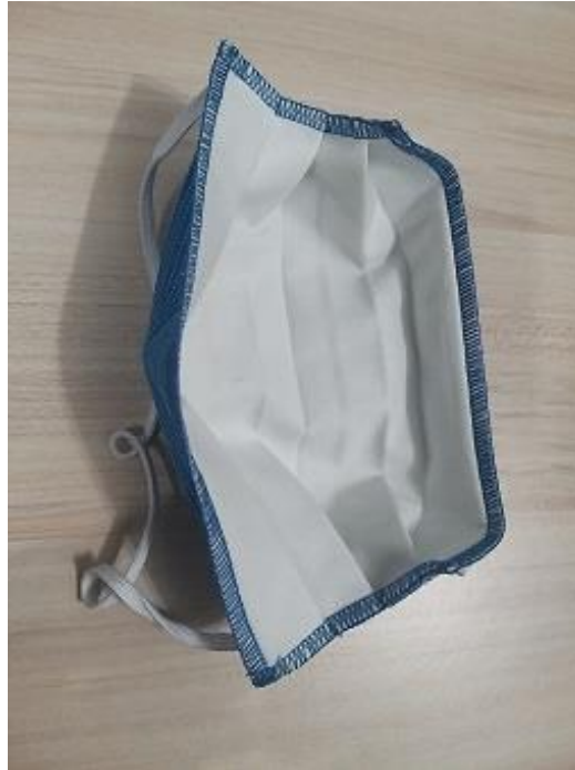
Medical face mask