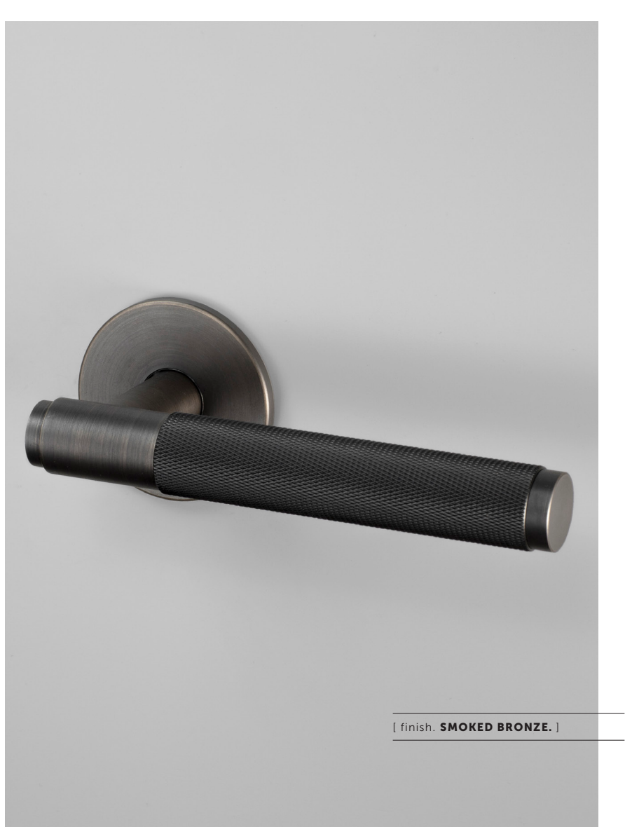
*All images are of the 4 mm thick Unsprung Door Handle Rose.