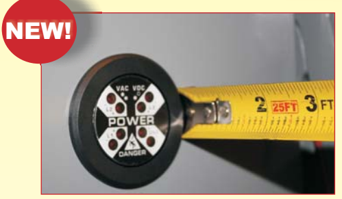
Dimensions of the Bezel - Diameter: 2.25" Outside cabinet depth: .20" Inside cabinet depth: 3.50"